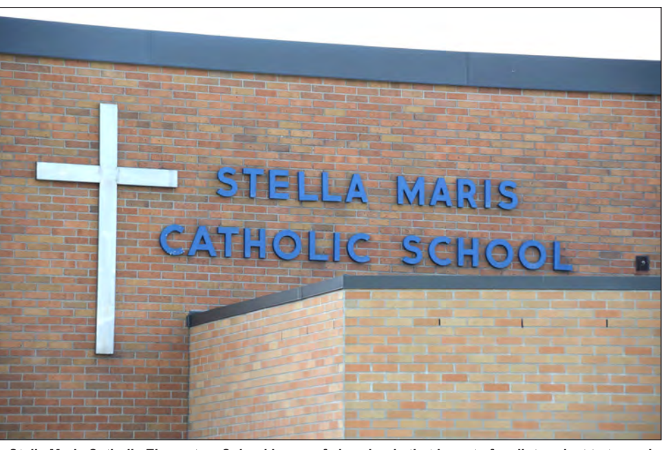
Stella Maris Catholic Elementary School is one of six schools that is part of a pilot project to try and encourage more students to walk and cycle to school. The active transportation project is through the Windsor-Essex County Health Unit (WECHU).